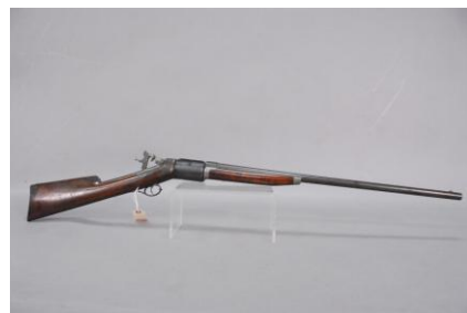
Roper Repeating Rifle Co 1867or68 16 gauge

Hopefully, the weather will be a bit nicer next month, but we are looking at December, then January and February.