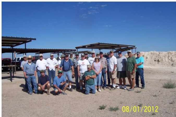
Shooters at the "O. F." Low Power Match, Wednesday August 1, 2012