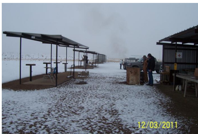
Before the Low Power Match 12-3-11

We had fog with visibility holding to about 700 meters. The temperatures were in the mid 30's, and with no wind. These conditions were great and it showed in the scores. This month we had 13 shooters.