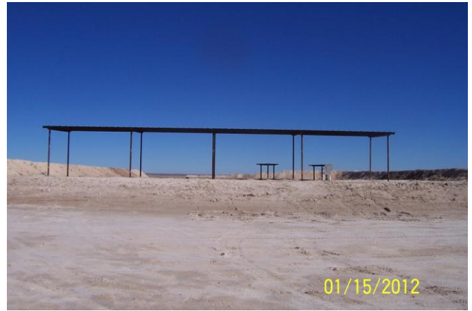
Shade on New Range #8

Due to high winds this day's match was cancelled.