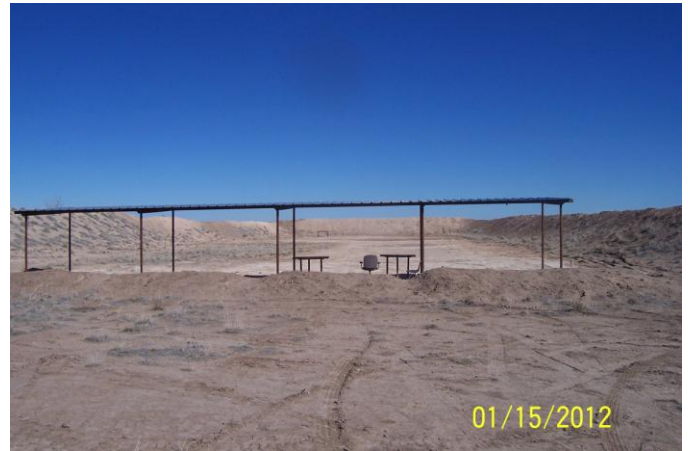
New shade on range #2 or "100 yd. Police Range"

The statistics on sanity is that one out of every four persons is suffering from some sort of mental illness. Think of your three best friends—if they are okay, then it's you.